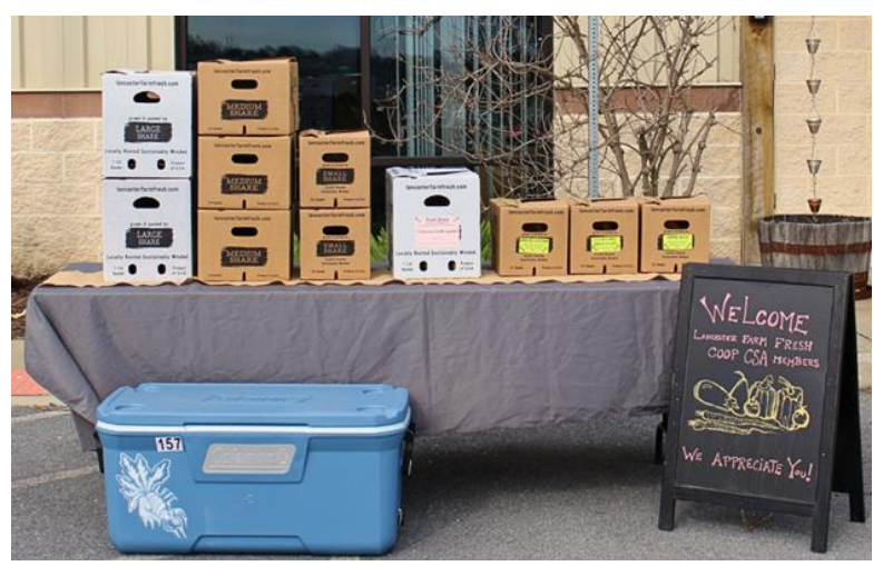
Example of Set-Up with the cooler and 3 different veg size boxes