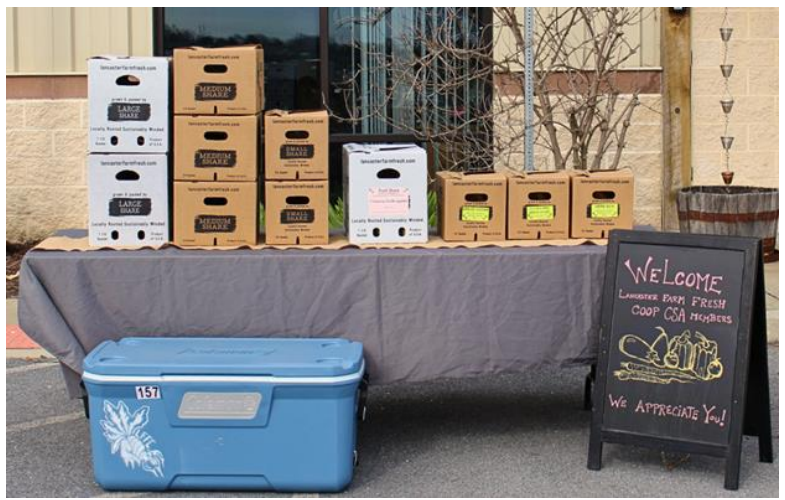
Example of Set-Up with the cooler and 3 different veg size boxes